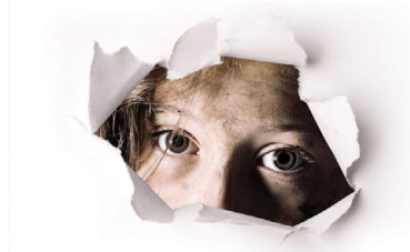
DISABILITY RIGHTS INTERNATIONAL